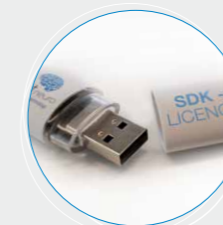
Certified SDK licence