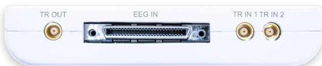
Front view amplifier, trigger in and output and EEG data transfer input (actual size). Trigger out not operational until further notice.