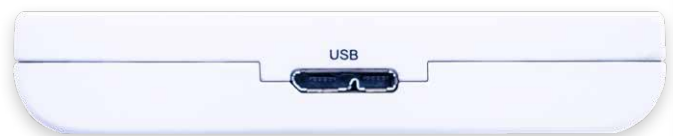
Back view amplifier, power supply and EEG data transfer output via USB 3 (actual size).